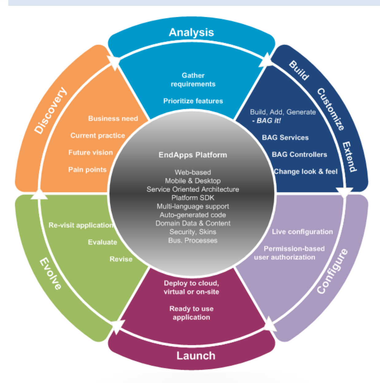
Figure 2: Project Implementation Life-Cycle